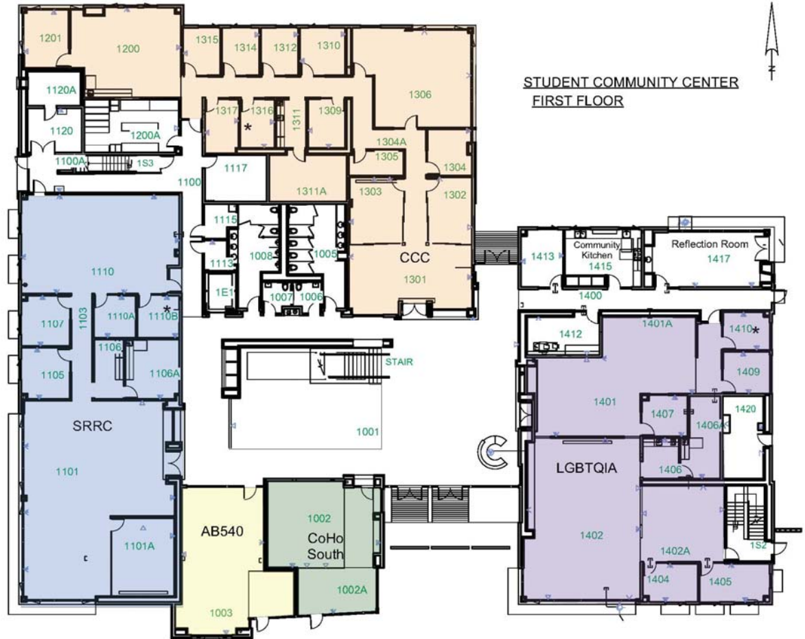
STUDENT COMMUNITY CENTER FIRST FLOOR