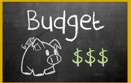
Rise in costs