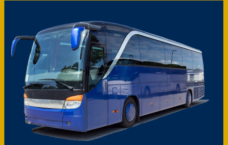
Dues and Travel