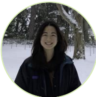
Danielle Lowe Landscape Architecture and Design