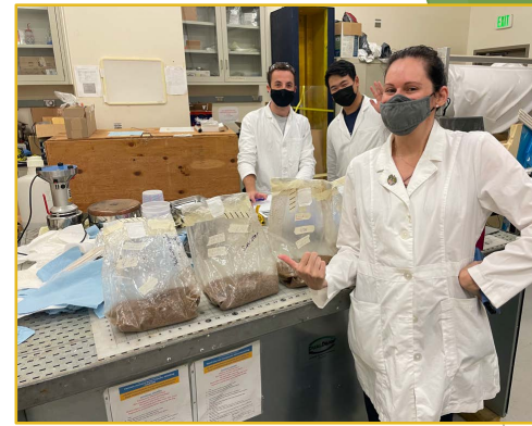
“Fungtopia Sustainability” Student researchers preparing samples for fungal inoculation.