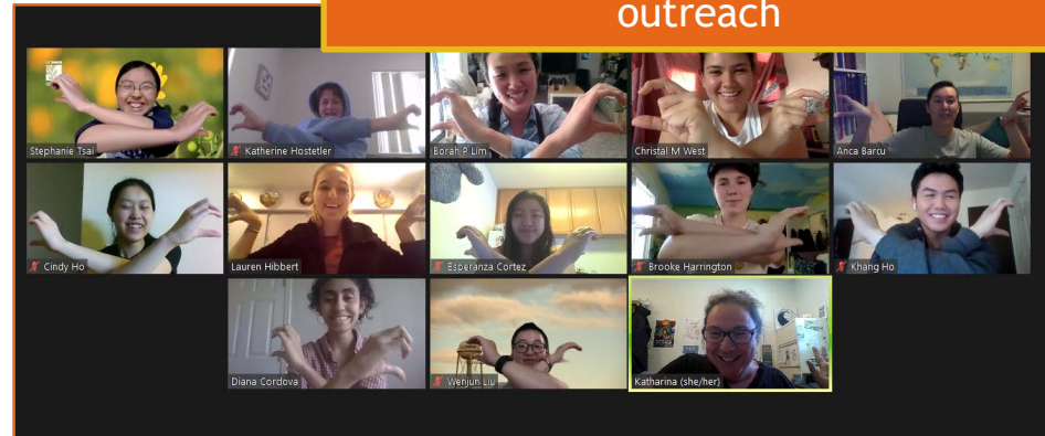
“Aggies Grow Veggies” Featured in College of Ag news article YouTube: @aggiesgrow Pivoted from in-person to online sustainable gardening education outreach